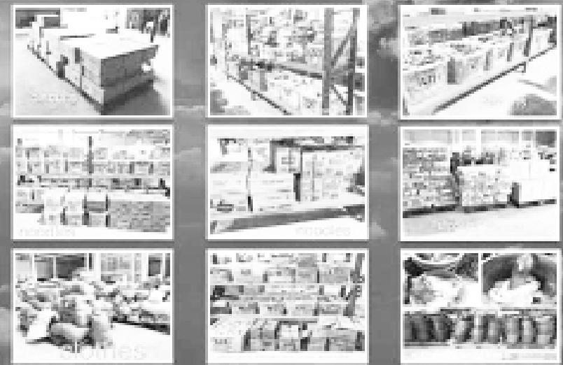
MULI, TAOS PUSONG PASASALAMAT NG MGA MAMAMAYAN NG LUNGSOD NG DASMARIÑAS.

Ang Pamahalaang Lungsod ng Dasmariñas ay TAOS-PUSONG NAGPAPASALAMAT sa lahat ng tumulong para sa Taal evacuees na nasa sampung (10) evacuation centers. Sa ngayon, sobra na ang tulong sa mineral water, canned goods, biscuits, noodles, bigas, at damit. Sa katunayan, heto ang litrato ng mga tulong na naka-stock sa aming warehouse at hindi pa kasama dito yong mga tulong na nasa mga evacuation centers. SA MGA NAGNANAIS PANG TUMULONG, IMINUMUNGKAHI NAMIN NA RAW FOODS ANG IPADALA KATULAD NG ITLOG, FRESH MEAT NG BABOY, MANOK AT BAKA, ISDA O GULAY. Nais din tumulong ng ating evacuees sa pagluluto at matimplahan nila ng lutong Batangas. Ang kanilang hanapbuhay ay panghuhuli ng tilapia at pagtitinda nito.